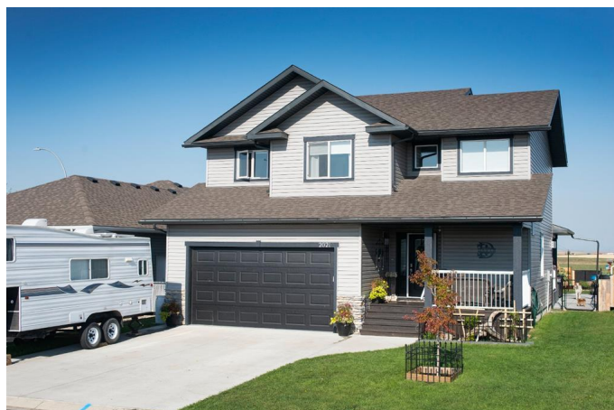
2021 31 Ave, Nanton, AB

Immaculate and spacious are great words to describe your future property. This 2 story home with a view offers 2073 sq.ft of living space on 2 levels plus a fully developed basement. If you enjoy entertaining than this property will check all the boxes. The front foyer is spacious and leads to a living room that boasts two-story high ceilings and a corner gas fireplace with stone surround. The natural lighting from the main floor and upper level light up this great living space. The kitchen features an abundance of cabinetry, countertop work space, a center island, corner pantry and a dining area with access to the covered back deck with gas line and the yard. The kitchen and backyard are perfect for those days and evenings with friends and family, now add the oversized concrete patio and the firepit area and just imagine the great times and memories to be made! The main floor laundry room doubles as a mud room and the 2 piece bath make the entrance off the garage extremely functional. On the second story you will find 3 bedrooms and a 4 piece bath. The master access is through the French doors, there is a walk in closet and a 5 piece ensuite with soaker tub and shower. The views from the master bedroom are spectacular! The basement is fully developed with dry bar, family room, 3 piece bath and a recreational room that is currently used as a guest bedroom. Need a 4th bedroom? This recreation room could easily be converted to a 4th bedroom, just add a wall! The yard is low