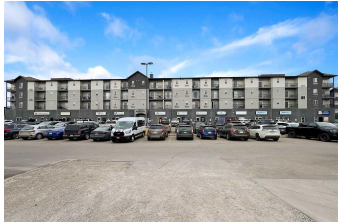
The Location - Downtown Fort McMurray

This excellent downtown retail development presents a rare opportunity for businesses