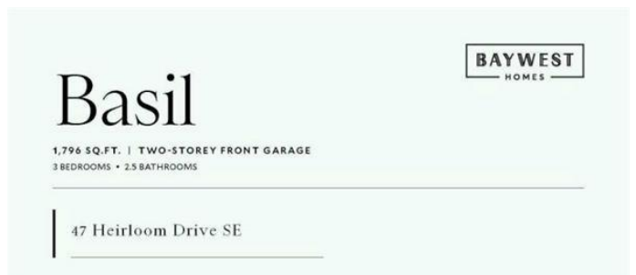
Main Floor 796 SQ.FT.