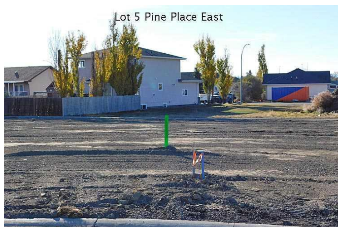
Lot 5 Pine Place East