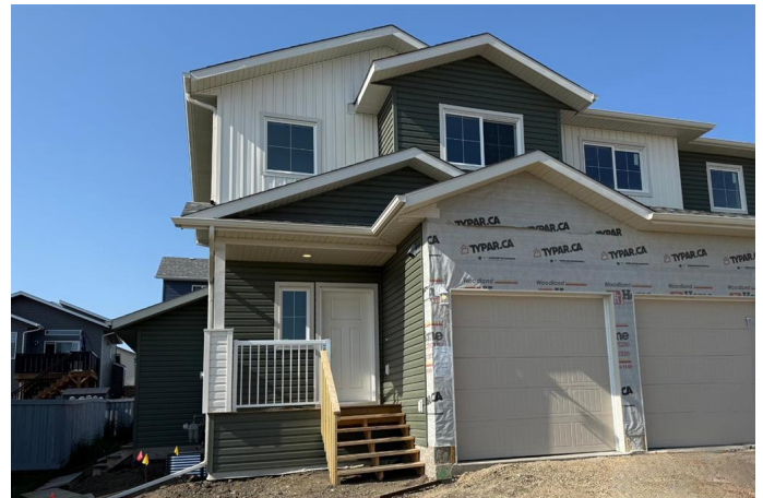
The Oxford II Duplex Unit with basement suite 1,337 s.f./ 1,316 s.f.