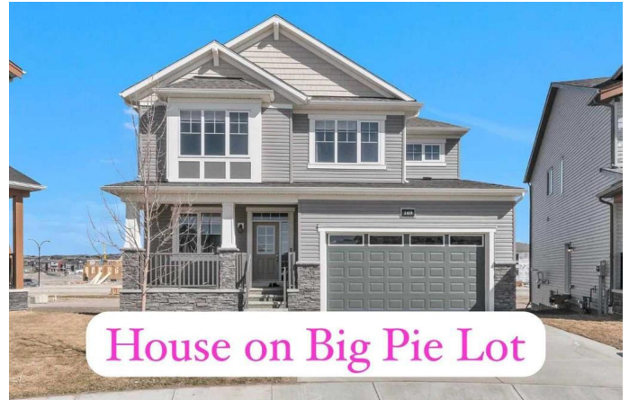
House on Big Pie Lot

Check out this stunning 2-storey detached home in the vibrant community of Carrington. Situated on a huge pie lot with no back-facing neighbours. This one-year-old home offers 3 bedrooms plus a den, 2.5 bathrooms, and a double-attached garage. Thoughtfully designed, it offers loads of upgrades (over $100,000) and is ideal for families and professionals alike. The open-concept layout features high-end engineered hardwood throughout the main level and 2nd floor, a show-stopping great room with soaring ceilings, expansive windows that fill the space with natural light, and a raised gas fireplace. The dining area flows effortlessly into the chef-inspired kitchen, complete with quartz countertops, upgraded cabinets with a lazy Susan and pot & pan drawers, a large island with breakfast bar, kitchen backsplash, SS chimney hood fan, and a corner pantry offering ample storage. The main floor office/den is great for working from home. A 2-pc bathroom on the main floor adds functionality. Upstairs, there are 9' ceilings throughout. The primary bedroom provides a relaxing retreat with a spacious walk-in closet and a 4-pc ensuite. The 2nd and 3rd bedrooms are bright and generously sized, each with its own walk-in closet, and are complemented by a full 4-pc bath. All bathrooms feature full-height mirrors, quartz countertops, and stylish backsplash details. A bright and airy loft adds flexibility as a second family lounge or playroom, while the laundry room with rough-in for sink adds