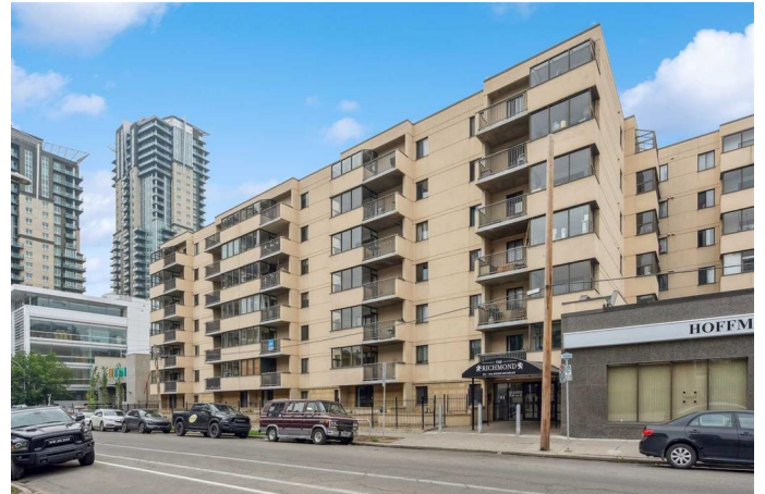
214 111 14 AVE SE - 06.12.2025 Main - 823.17 sq.ft / 76.47 m 2 RMS Area - 823.17 sq.ft / 76.47 m 2